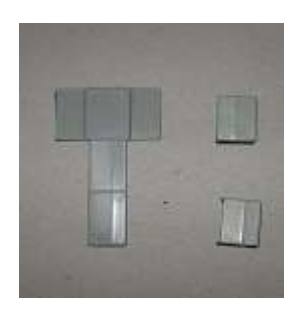
Fig. 1-1 Fig. 1-2 Fig. 1-3