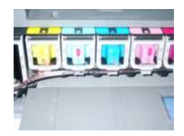
Fig. 3-5 Fig. 3-6 Fig. 3-7

NOTE: The air in the tube is OK, it has no effect on the printing performance.