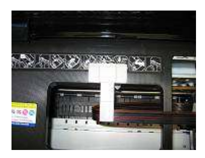
Fig.3-4 Fig.3-5 Fig.3-6