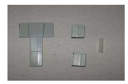
Fig. 1-1 Fig. 1-2 Fig.1-3