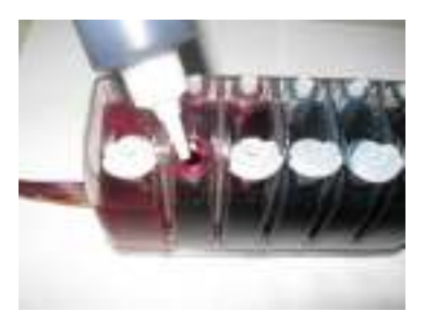
Fig 5-1 Fig 5-2 Fig 5-3