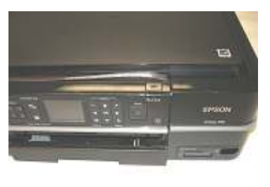
Fig 4-1 Fig 4-2 Fig 4-3

d. Turn on the printer and make sure the system moves smoothly.