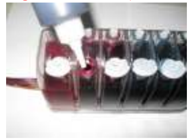
Fig 5-1 Fig 5-2 Fig 5-3